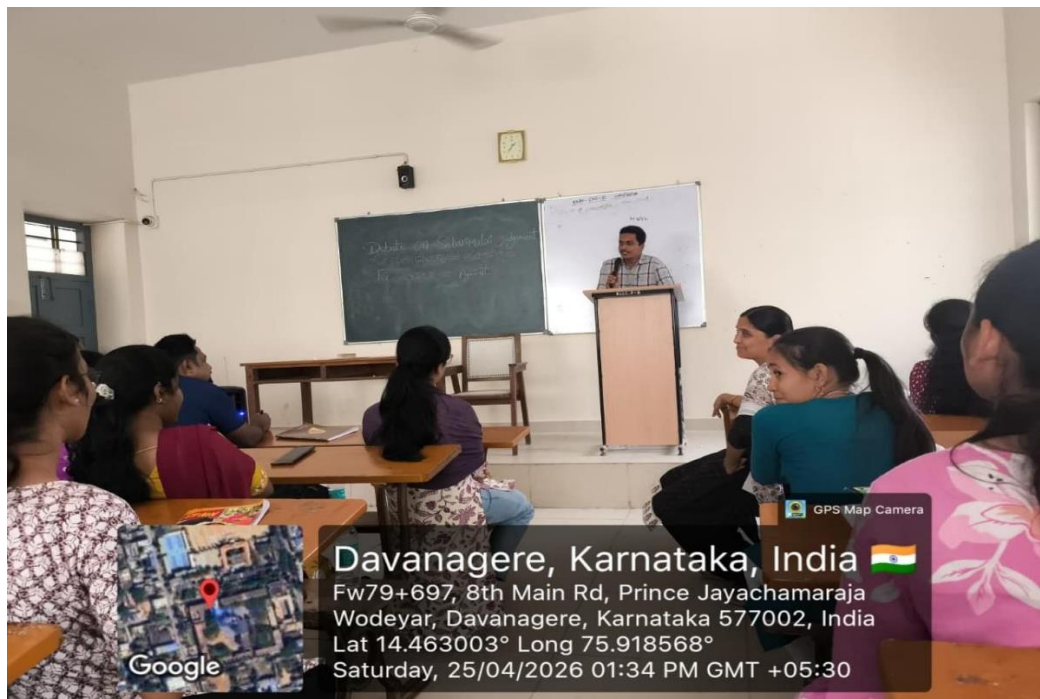
Photo 6. Participant presenting arguments on AI in the legal profession.