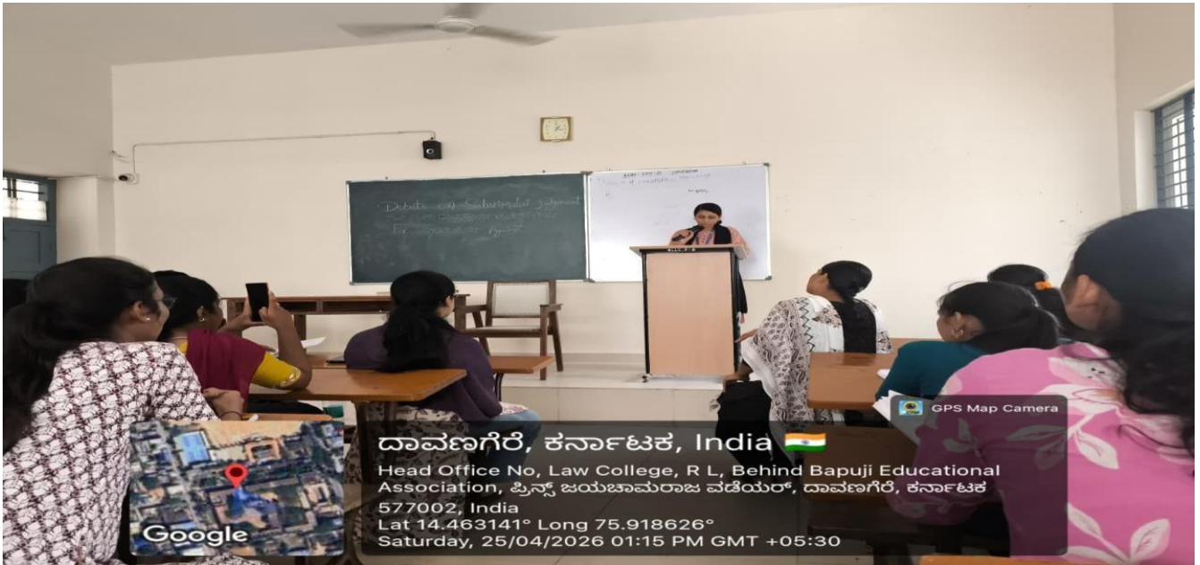
Photo 5. Energetic and thought-provoking debate conducted at R.L. Law College.