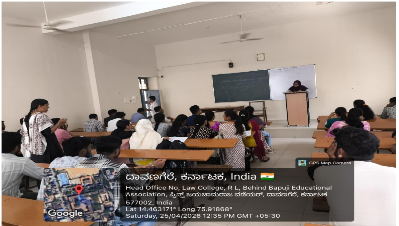
Photo 1. Faculty member addressing students during the debate session.