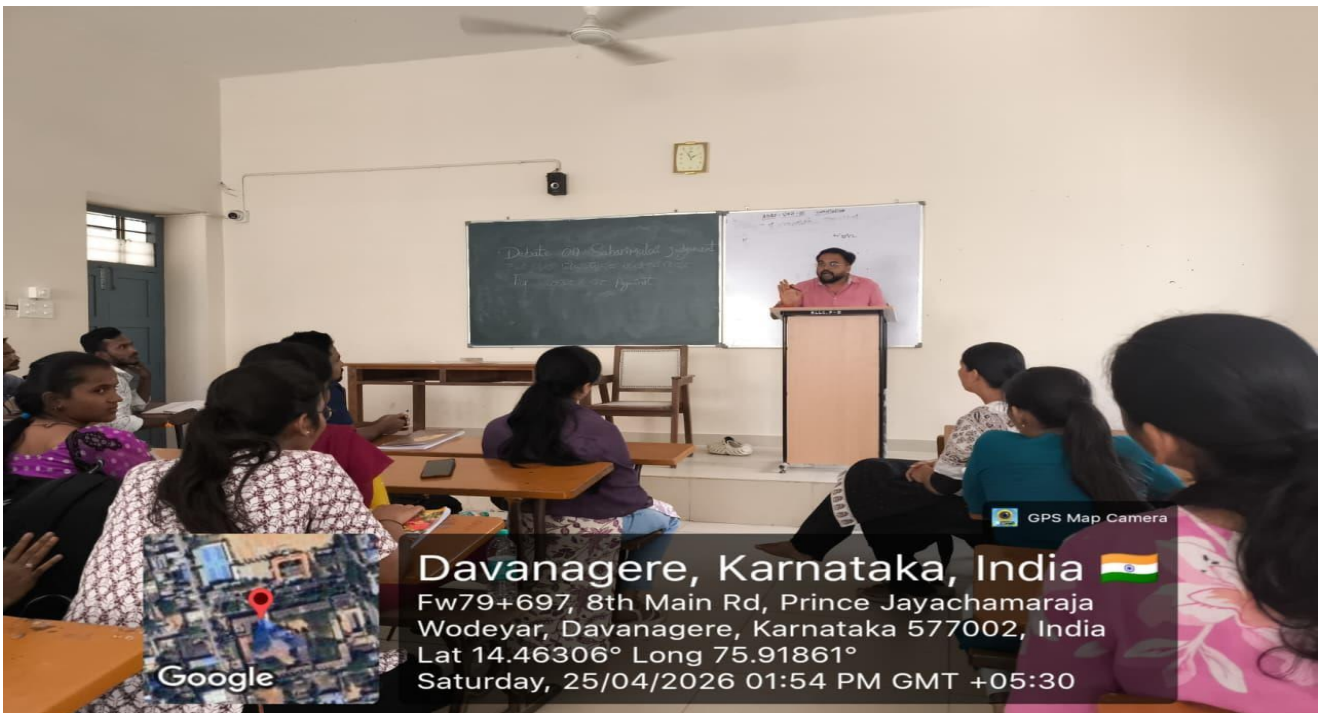
Photo 4. Student speaker expressing arguments on contemporary topics.