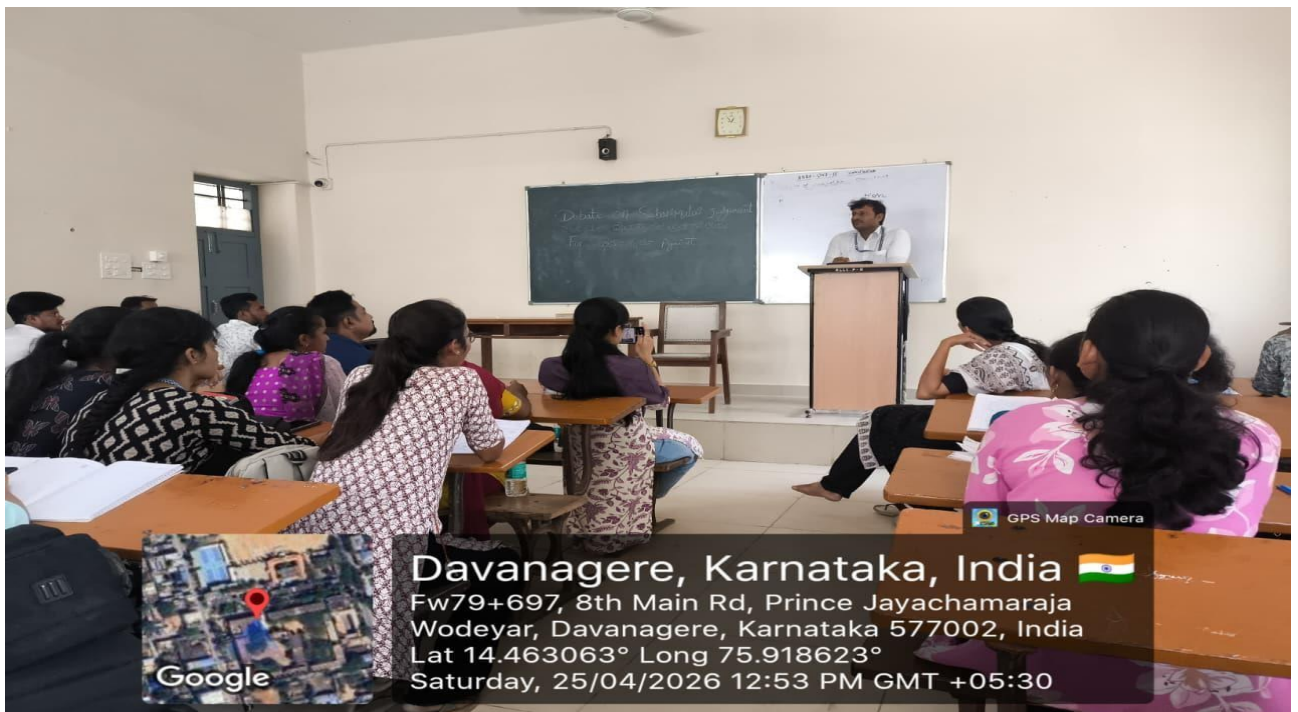
Photo 2 . Debate in progress with active participation of students.