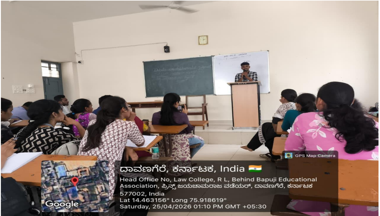
Photo 3. . Student participant presenting views on legal issues